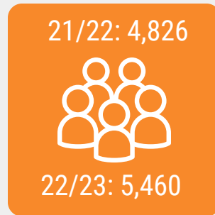
Total Patron Cards