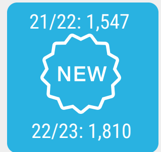
New Books, DVDs, and Audio Books