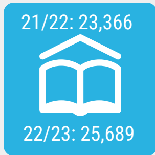
Circulation of Books, DVDs, and Audio Books