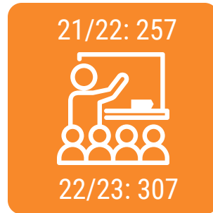
Programs and Workshops